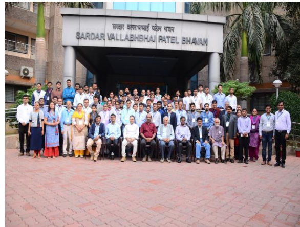
(b) Group Photograph