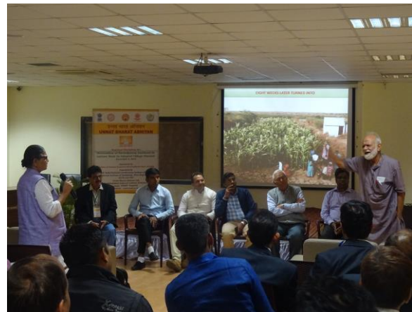
(l) Sharing of experience by experts from various fields