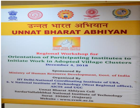
(a) Unnat Bharat Abhiyan banner