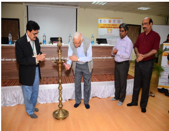
(c) Lamp lighting by dignitaries for inaugurating the function